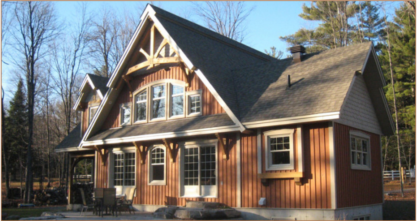
Stylish home and spacious open area all with mezzanine and garage